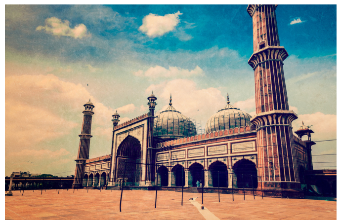
Jama Masjid, Delhi