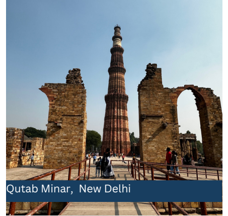
Qutab Minar, New Delhi