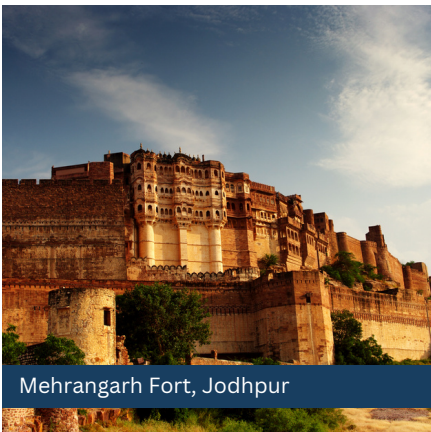
Mehrangarh Fort, Jodhpur