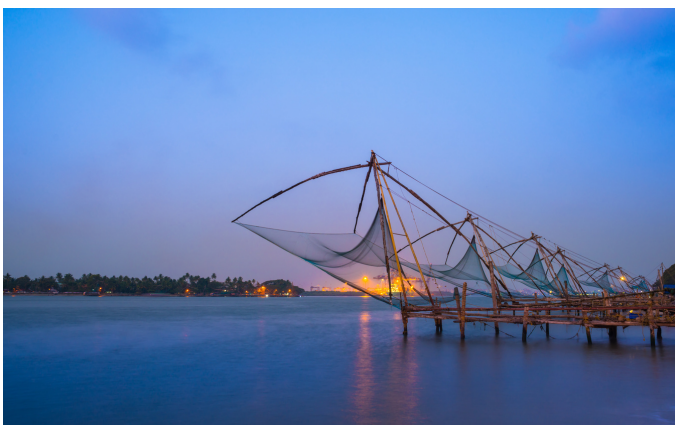
Chinese Fishing Nets , Fort Kochi