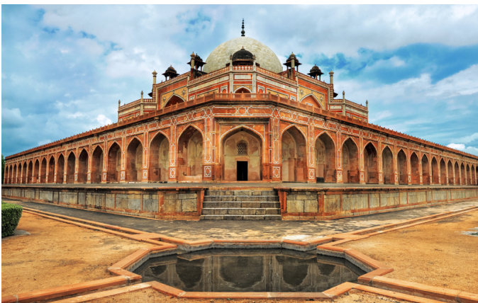
Tomb of Humayun., New Delhi

Drive past the Red Fort, The red sandstone walls of Lal Qila, the Red Fort, extend for just over a mile and vary in height from 59 ft on the river side to 108 ft on the city side. Shah Jahan started construction of the massive fort in 1638 and it was completed in 1648.