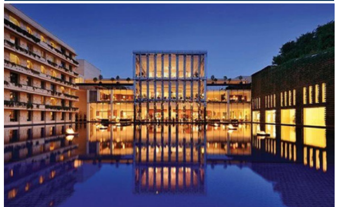
The Oberoi Hotel , Gurugram