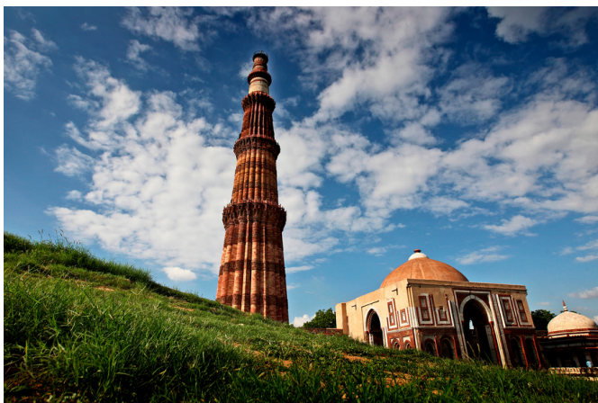
Qutab Minar, New Delhi