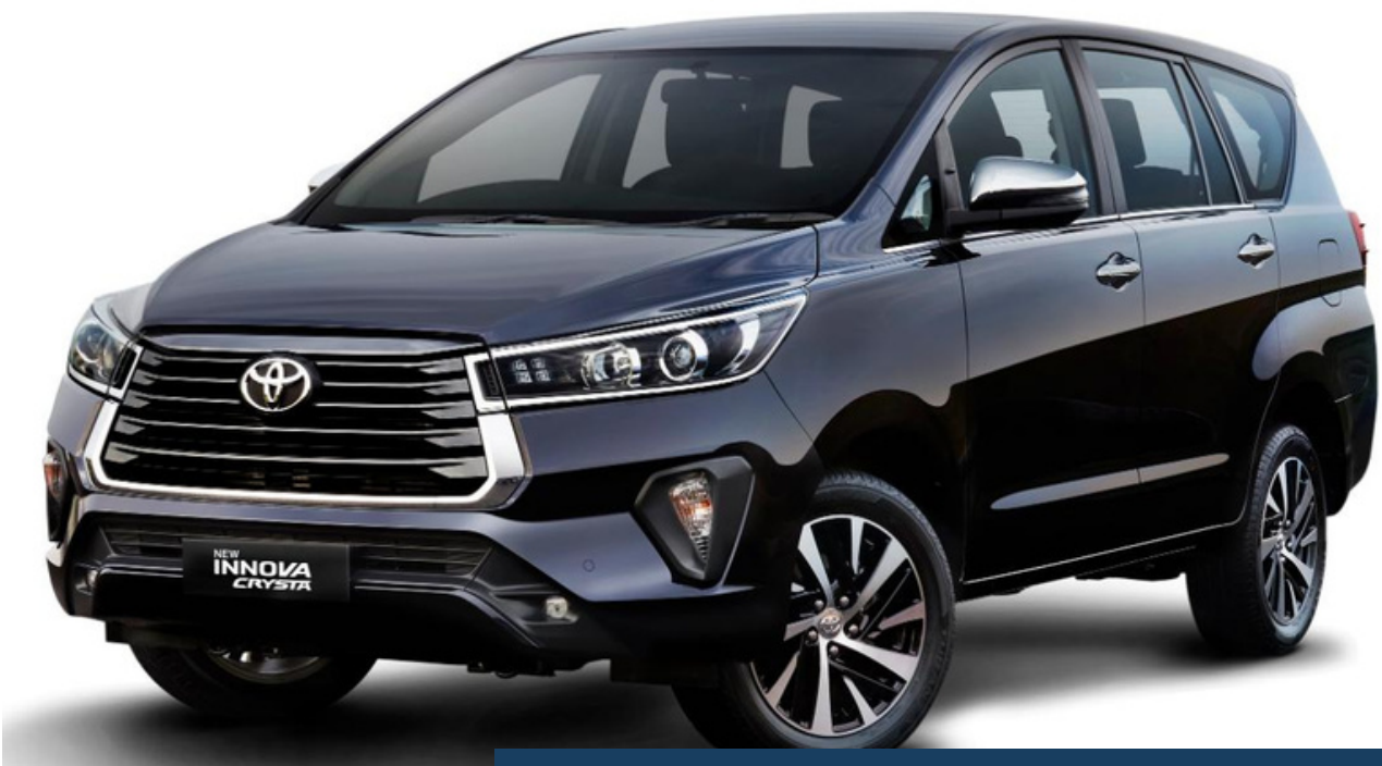
Toyota Innova Crysta