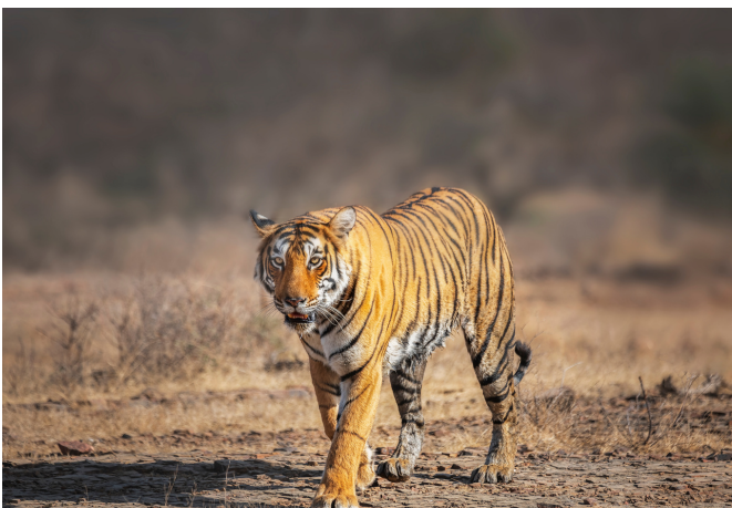
Royal Bengal Tiger

Optional activity : visit an Elephant family in Jaipur OR an additional Game drive in Ranthambhore.