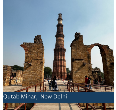
Qutab Minar, New Delhi