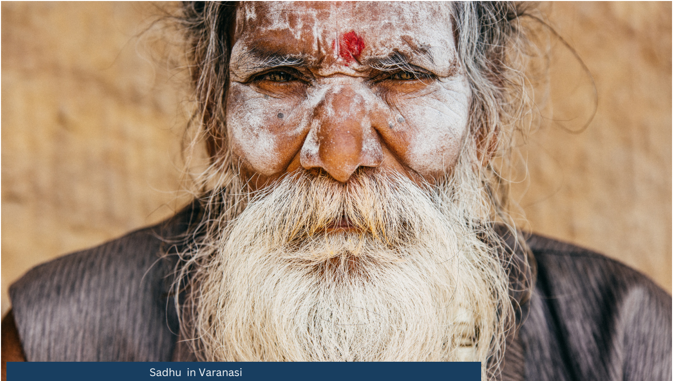
Sadhu in Varanasi

Rooms ready for wash and change. Dinner at Hotel. Later, you would be transferred to the New Delhi International airport for your flight back home (as per your International flight timings).