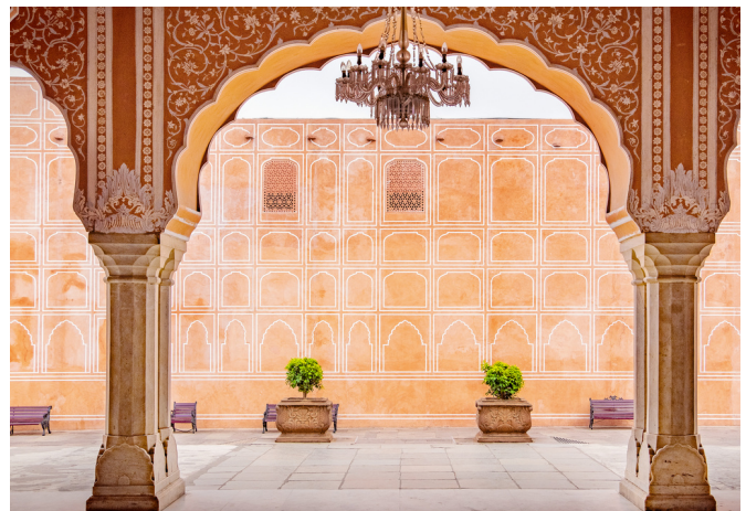
City Palace, Jaipur