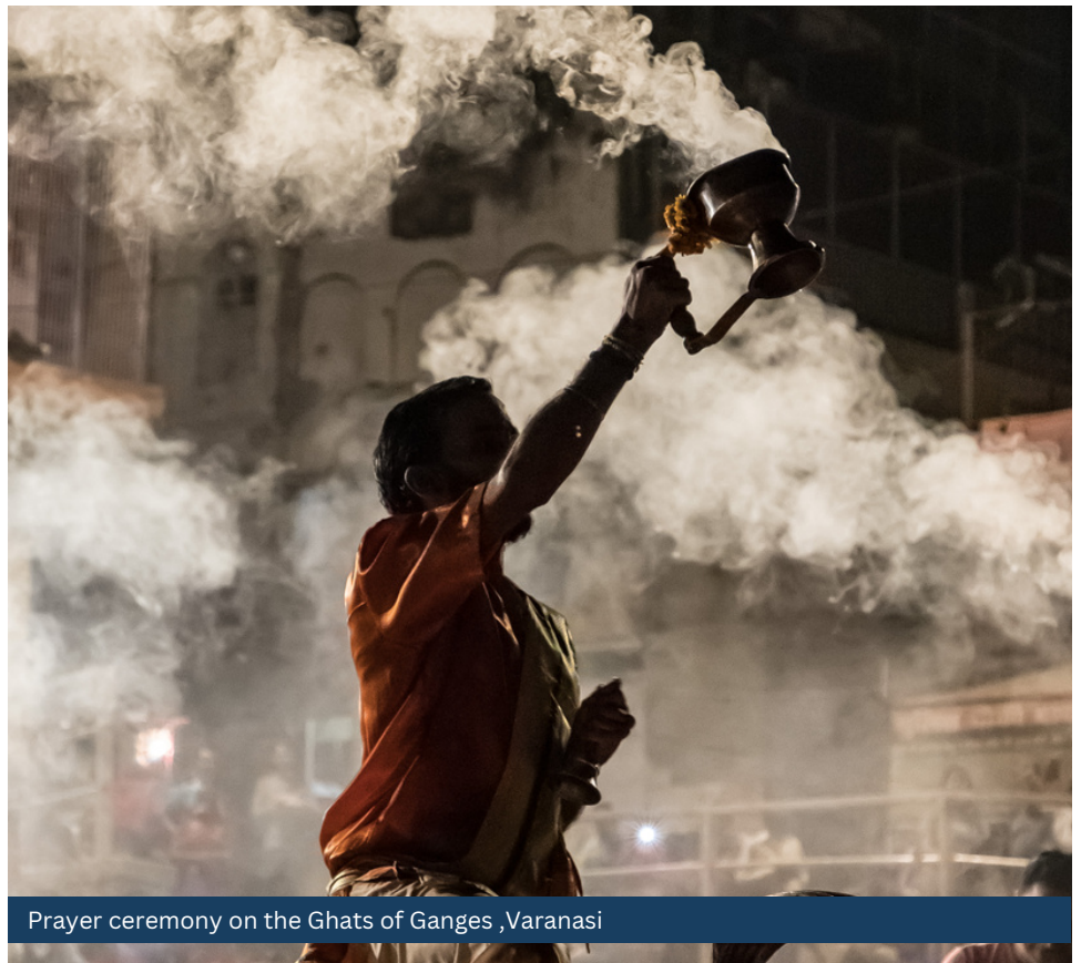
Prayer ceremony on the Ghats of Ganges ,Varanasi