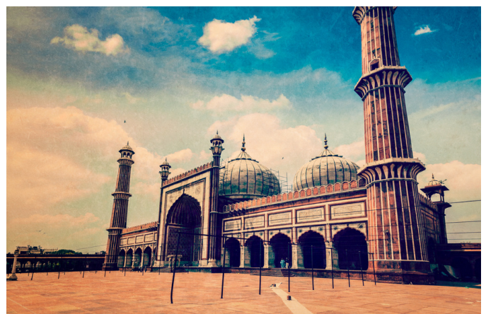
Jama Masjid, Delhi