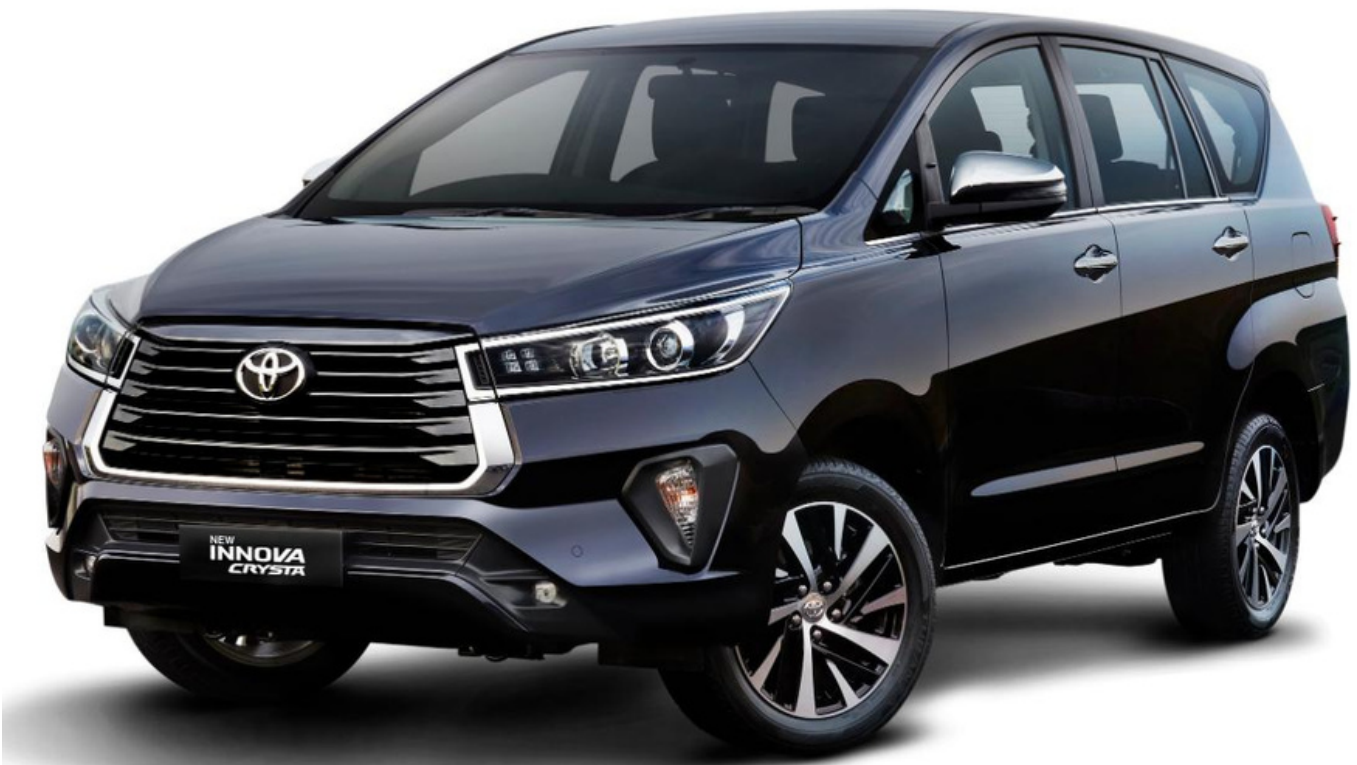
Toyota Innova Crysta 07 seater (02-04 Pax)