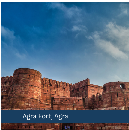
Agra Fort, Agra