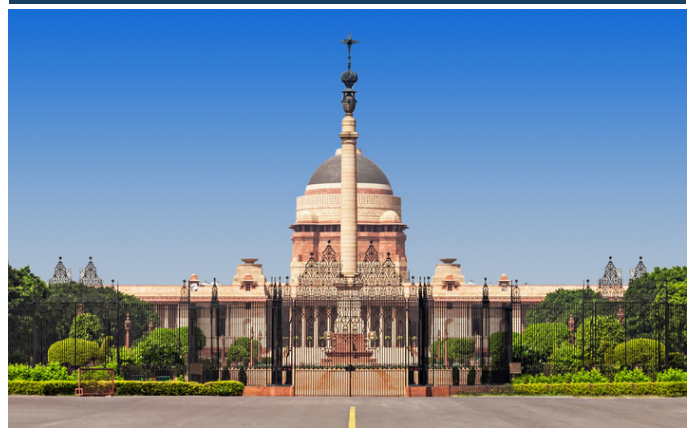
President's Palace, New Delhi