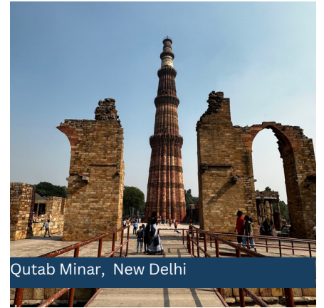
Qutab Minar, New Delhi