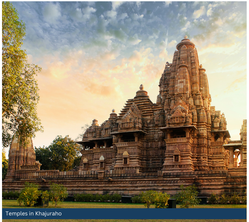
Temples in Khajuraho