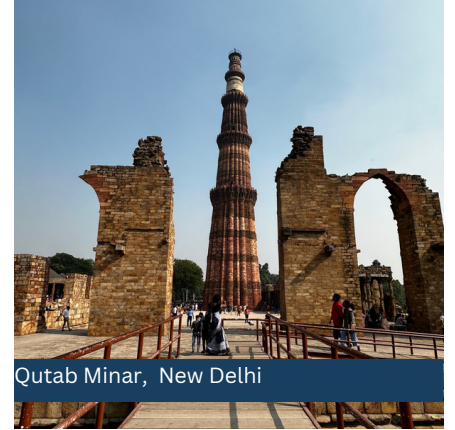
Qutab Minar, New Delhi