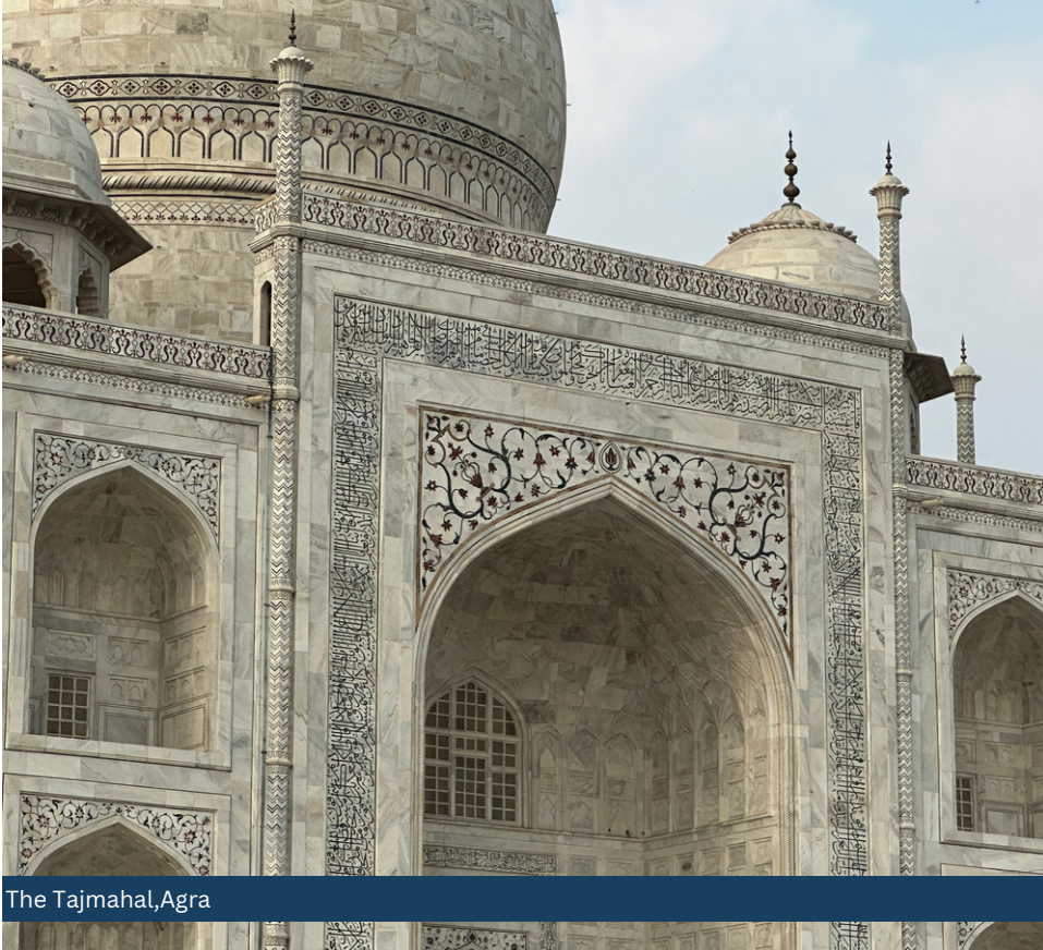
The Tajmahal, Agra