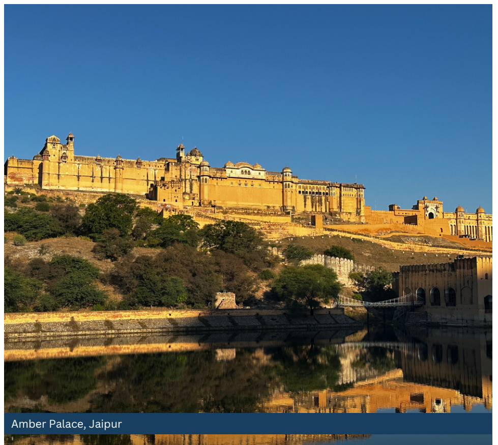
Amber Palace, Jaipur