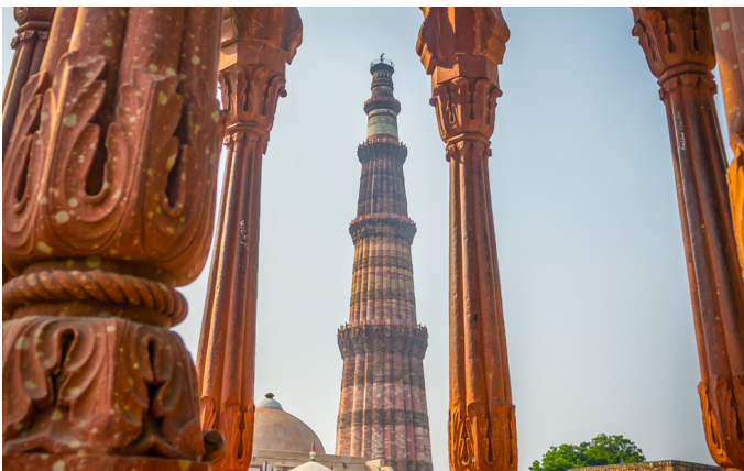
Qutab Minar, New Delhi

Drive past the Red Fort, The red sandstone walls of Lal Qila, the Red Fort, extend for just over a mile and vary in height from 59 ft on the river side to 108 ft on the city side. Shah Jahan started construction of the massive fort in 1638 and it was completed in 1648.