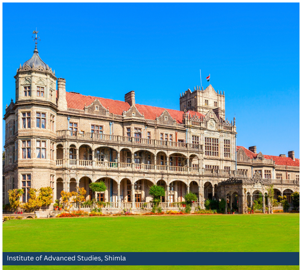
Institute of Advanced Studies, Shimla