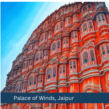
Palace of Winds, Jaipur