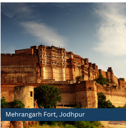
Mehrangarh Fort, Jodhpur