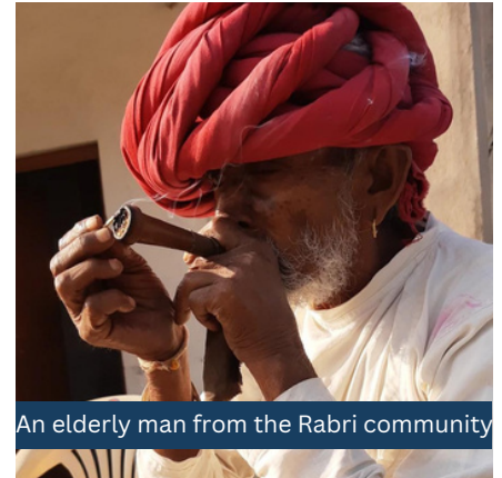
An elderly man from the Rabri community