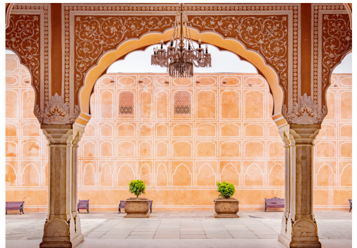
Jaipur City Palace