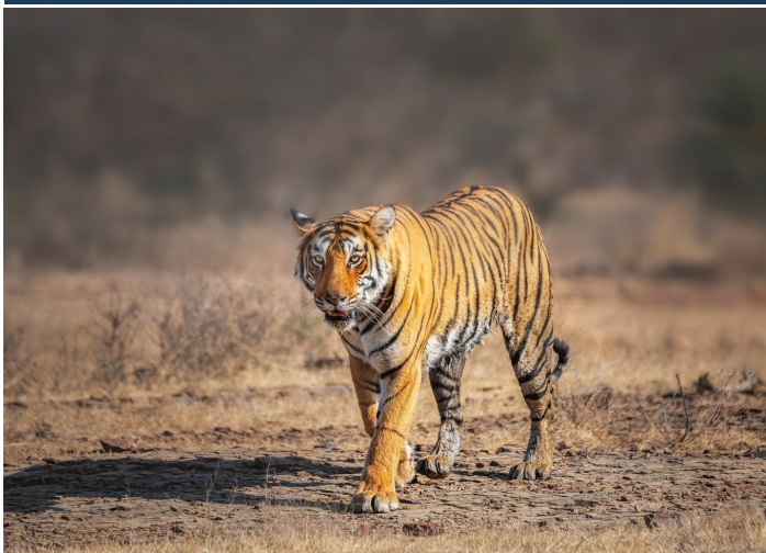
Royall Bengal Tiger , Ranthambore

The city of Jaipur is famous for its hilltop fortresses, magnificent royal palaces and historic pink-painted sandstone architecture, earning it the affectionate nickname of the 'Pink City'. The buildings within the Old City district of Jaipur were first painted pink in 1876 to welcome the current Prince of Wales, and this tradition has remained ever since. Afternoon at leisure for individual activities.