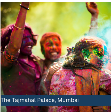
The Tajmahal Palace, Mumbai